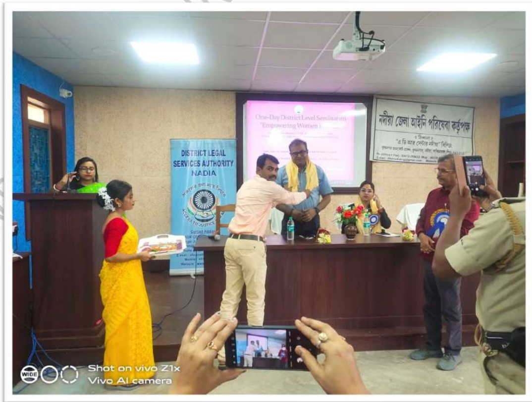
Report of various General programme of NSS Unit-2022-23