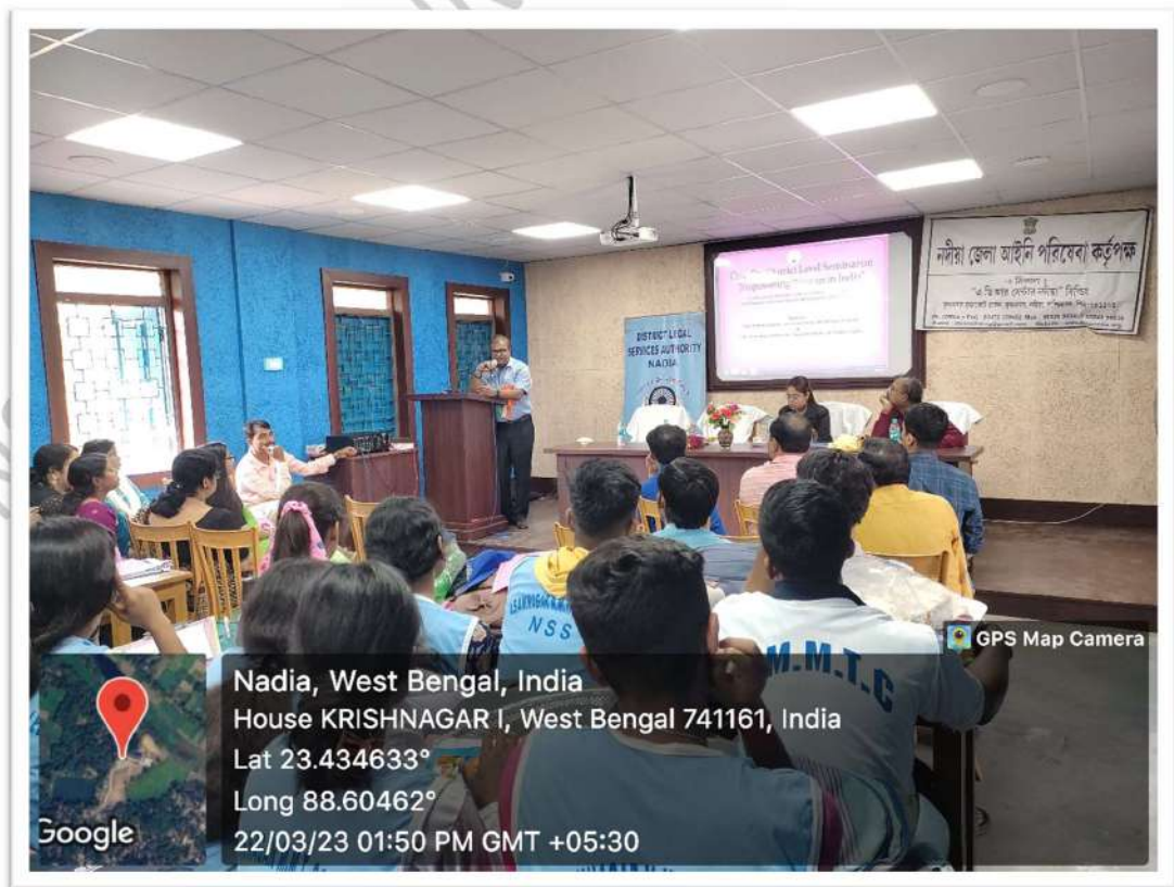
Report of various General programme of NSS Unit-2022-23